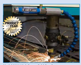
Model 5230 High Power Cold Gun System

Cooling a roll with 20°F (-7°C) air keeps the material on the surface from bunching up, jamming or tearing. The metal surface transfers the cold temperature to the product.