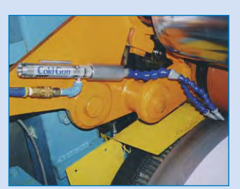
Model 5315 Cold Gun System

Fly cutters up to 460mm in diameter have been cooled with the Cold Gun. Dissipating heat with cold air extends tool life, increases speeds and feeds, and improves finishes.