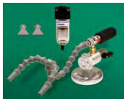
Model 3308 Mini Cooler System (two cold outlets)

Includes Mini Cooler, Single Point Hose Kit, Swivel Magnetic Base and Manual Drain Filter Separator with Mounting Bracket.