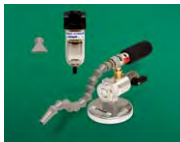
Model 3808 Mini Cooler System (one cold outlet)

Includes Mini Cooler, Single Point Hose Kit, Swivel Magnetic Base and Manual Drain Filter Separator with Mounting Bracket.