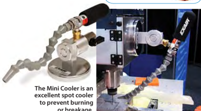
The Mini Cooler is an excellent spot cooler to prevent burning or breakage.