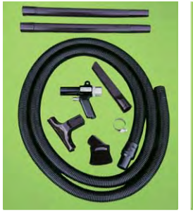
Model 6292 Transfer System includes Vac-u-Gun, 10' (3m) vacuum hose, brush, crevice tool, skimmer tool and (2) extension wands.