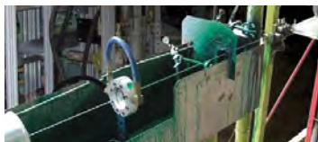
A Model 2431 1" (25mm) Standard Air Wipe blows off the excess coating from a wire into a dip tank.