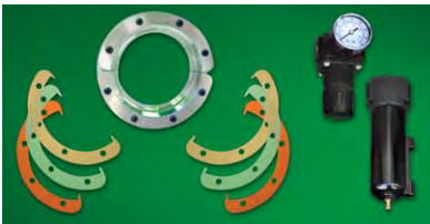
The Standard Air Wipe Kit includes a shim set, filter separator and pressure regulator (with coupler).

The compressed air exhausts through a gap which is set with a shim positioned between the cap and the body of the Standard Air Wipe. It is shipped with a .002" (0.05mm) thick plastic shim installed which works best for most applications. Force and flow may be easily increased by adding shims to open the gap. Increasing the gap opening offers higher velocity and harder hitting force. Air consumption and noise will be slightly higher. Air Wipe shim sets are available that include one each of a .001" (0.03mm), .003" (0.08mm), and .004" (0.10mm) thick shims. Shim sets are included with all kits or may be purchased separately.