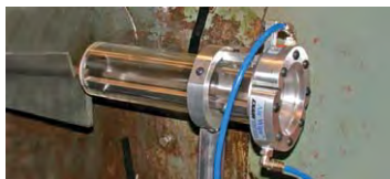
The Standard Air Wipe blows coolant off the part and back into the centerless grinder.

Special diameter Standard Air Wipes are available. Please contact our factory.