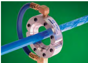
The Standard Air Wipe removes liquid from a plastic rod.

The Standard Air Wipe is a good choice when the added durability of stainless steel screws, shims and hose are not required. The Standard Air Wipe uses coated screws, plastic shims and a general purpose PVC coupling air hose on sizes up to 4" (102mm). The Standard Air Wipe is best suited to applications in non-corrosive environments where temperatures do not exceed 150°F (66°C). The dimensions and performance of this product are the same as that of the Super Air Wipe which is detailed on page 40.