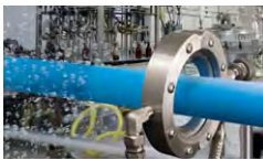
The stainless steel Super Air Wipe is ideal for food and pharmaceutical applications.