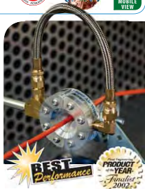
A 3/8 in Super Air Wipe uniformly dries a hose as it exits a cooling bath.

All models include stainless steel screws and shims. Stainless steel wire braided hose is also included on sizes up to 4" (102mm) for added corrosion and heat resistance. Aluminum models are rated for temperatures up to 400°F (204°C) and stainless steel models for temperatures up to 800°F (427°C).