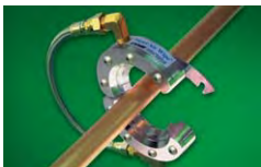
The split design of the Super Air Wipe unlatches easily to eliminate threading.