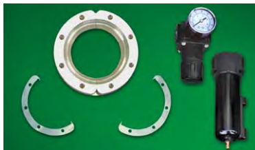
The Super Air Wipe Kit includes a stainless steel shim set, filter separator and pressure regulator (with coupler).

Special diameter Super Air Wipes are available. Please contact our factory.