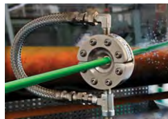
EXAIR's 1/2" Super Air Wipe dries a wire as it exits a cooling bath.