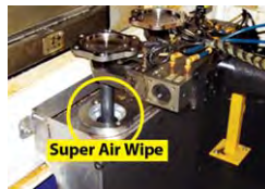
The flanged end of an axle is lifted through a Super Air Wipe to blow off chips after machining.