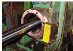
A Model 2404 4" (102mm) Super Air Wipe cleans a steel rod after processing.