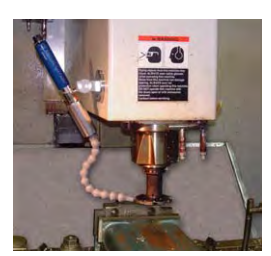
The Adjustable Spot Cooler replaces flood coolant and eliminates hours of cleanup on a cast iron machining operation.